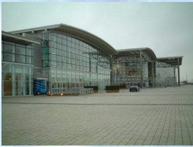
Braehead Shopping Centre, Glasgow Curtainwall Remedial Works