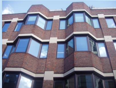
National Magazine House Window Remedial Works