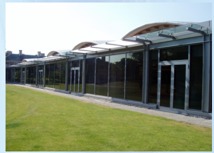
Great Burgh House, Epsom Curtainwall Remedial Works