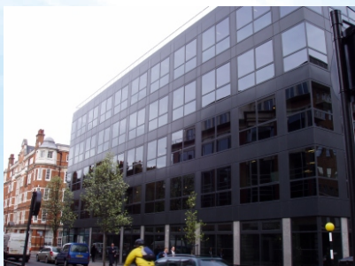
New Cavendish Street, London Curtainwall Remedial Works