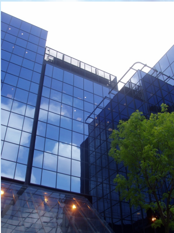
Harbour Exchange, London Remedial Works to Bomb Damaged Curtainwall