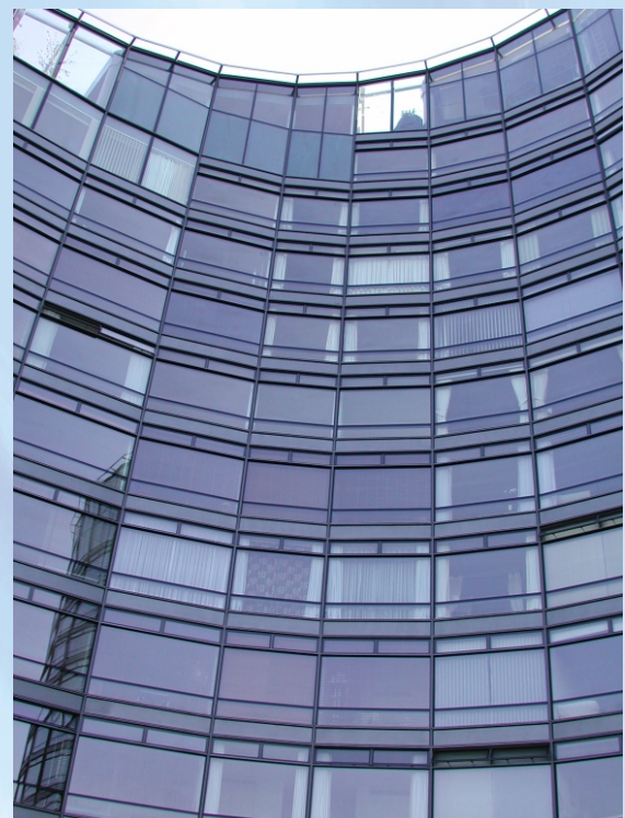
Parliament View, London Reglazing Works to Bespoke Curtainwall