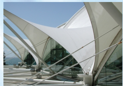
Saga Headquarters, Folkestone Extensive Remedial Works to Frameless Glazing