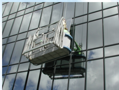
Hyatt Regency Hotel, Birmingham Extensive Reglazing Works